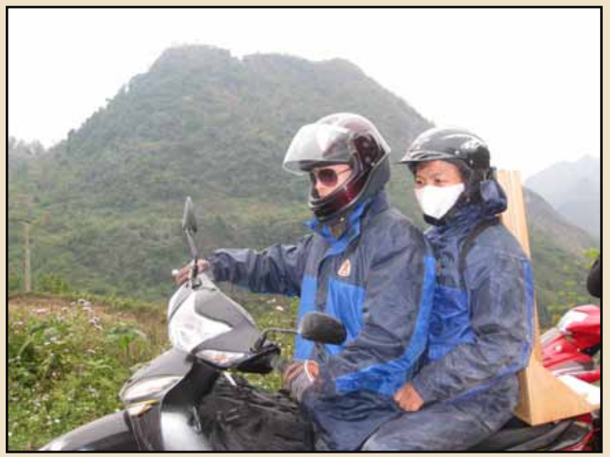
Wearing special suits protecting from wind and dust the team leader and measurer are ready to go. Ban Co village, Cao Bang province