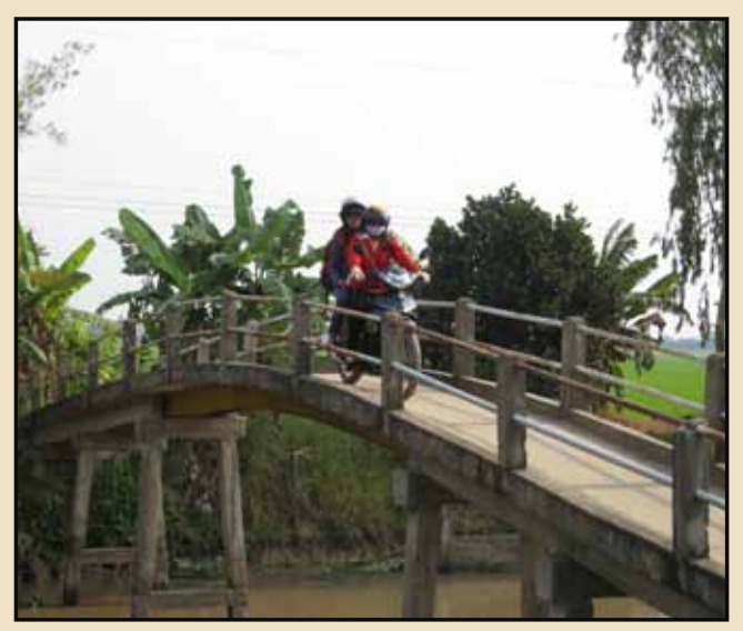
It will take you across and much further. Tan Thanh, Kien Giang