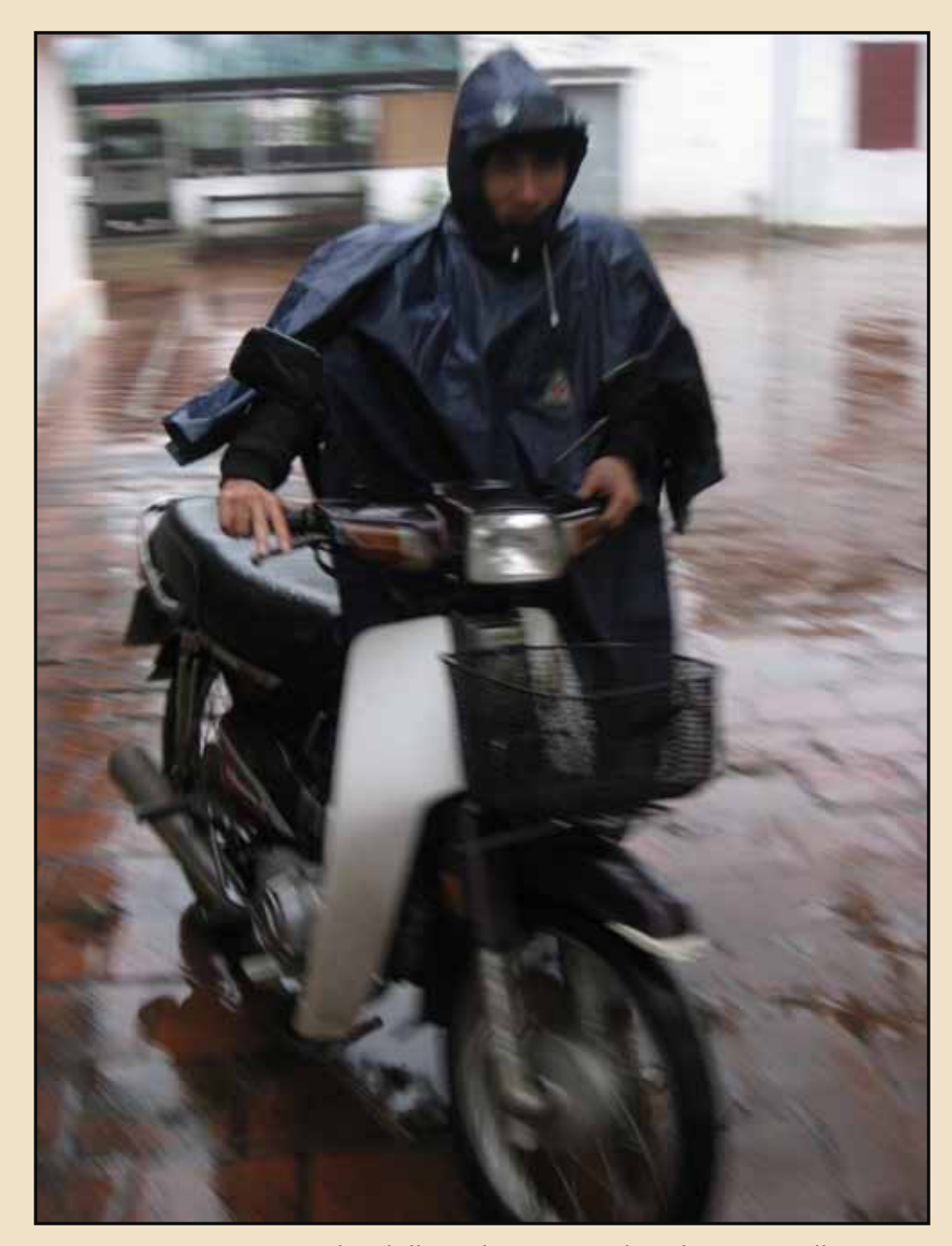
In the chilly and rainy weather the MICS still goes on. Vinh city, Nghe An province