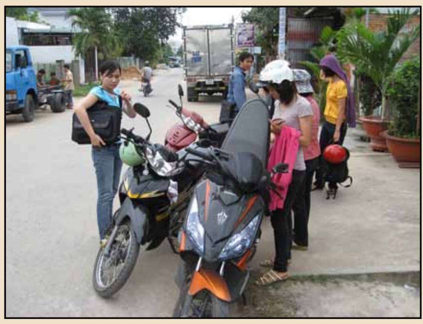
Just reached the selected area and the team is getting ready for the field work. District 12, Ho Chi Minh city