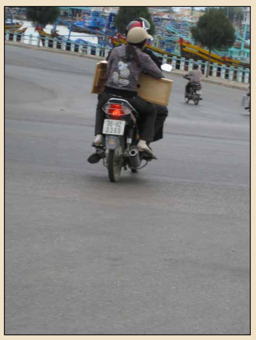
After the morning interviews the team on the move to have lunch. Phan Thiet, Binh Thuan