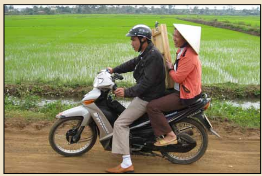
Local guide directs the measurer to the correct location while (incorrectly) carrying the equipment. Ea Kar, Dak Lak