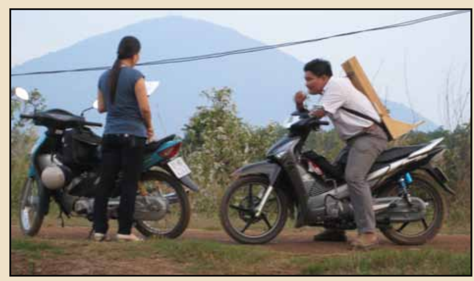
Team leader and measurer check the remaining households to be visited in Tan Binh, Tay Ninh