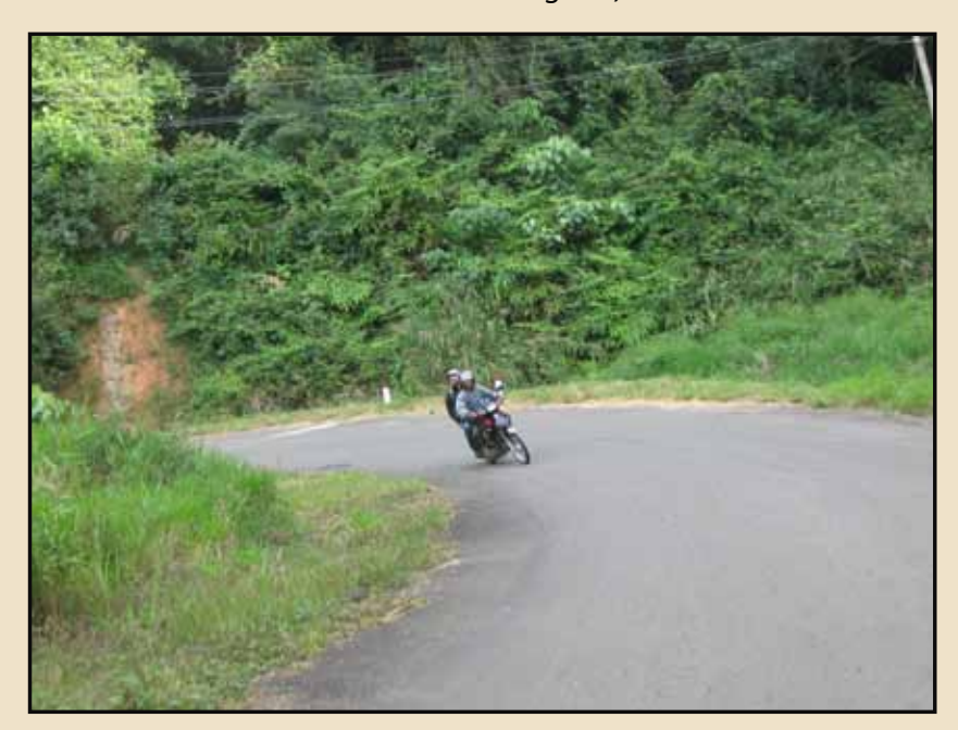
Uphill and downhill again and again. The 120 km ride from Di Linh town to Phan Thiet city could only be done by motorbike. Lam Dong province