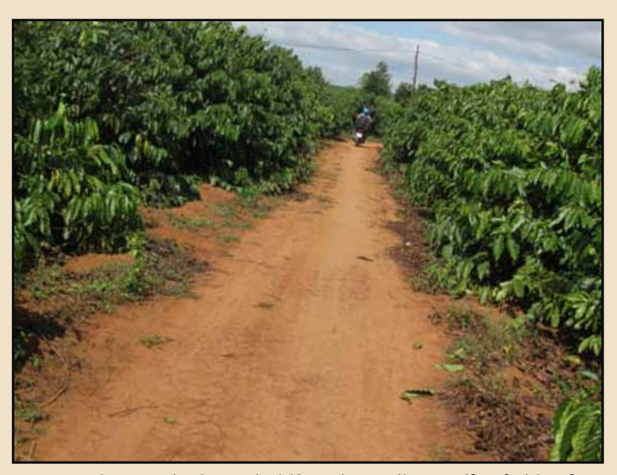
Where is the household? In the endless coffee fields of Bo Ngoong village the motorbike is the most effective way to carry out the MICS field work. Gia Lai province