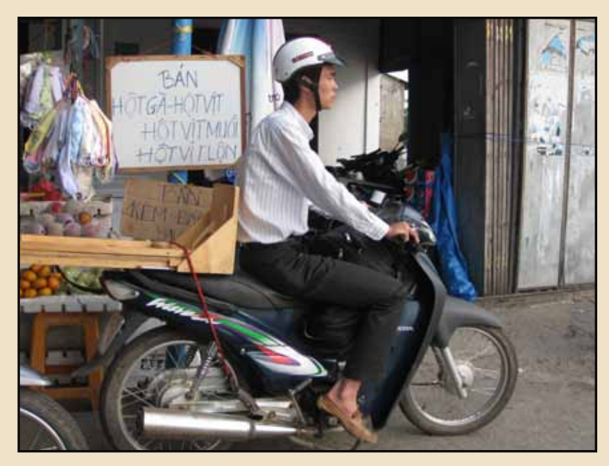
On the narrow streets, between local vendors, the measurer is riding the motorbike undeterred. Rach Gia town, Kien Giang province