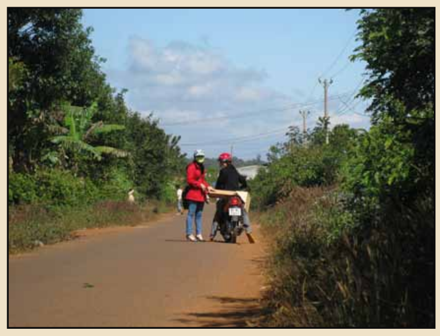
MICS interviewers are informed to go back, since the eligible woman just returned home from the field. Bo Ngoong, Gia Lai