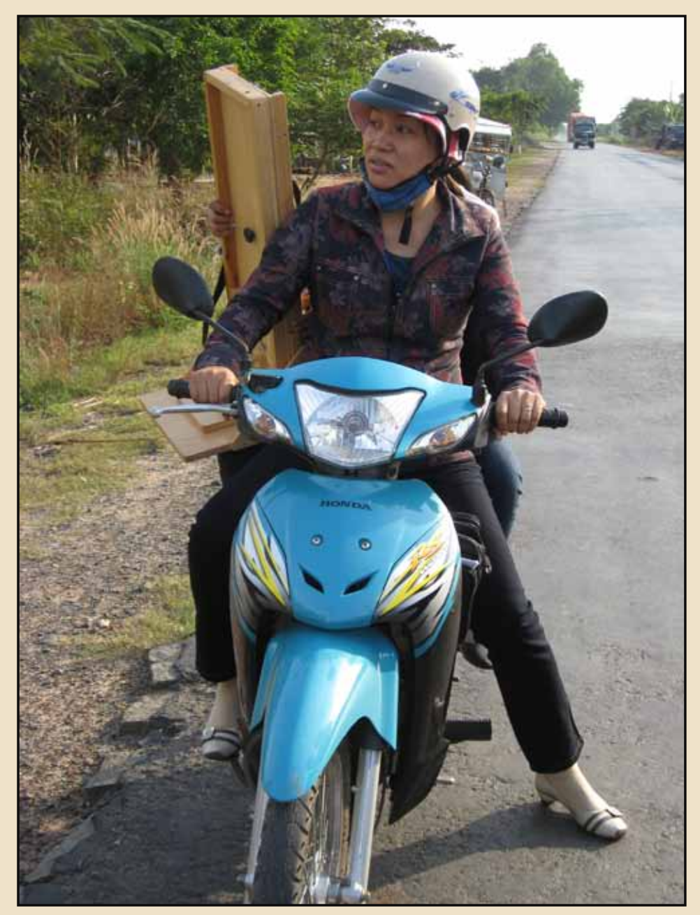
Just spotted the next household. It is easier to carry the measurement equipment with a motorbike. Tan Binh commune, Tay Ninh province