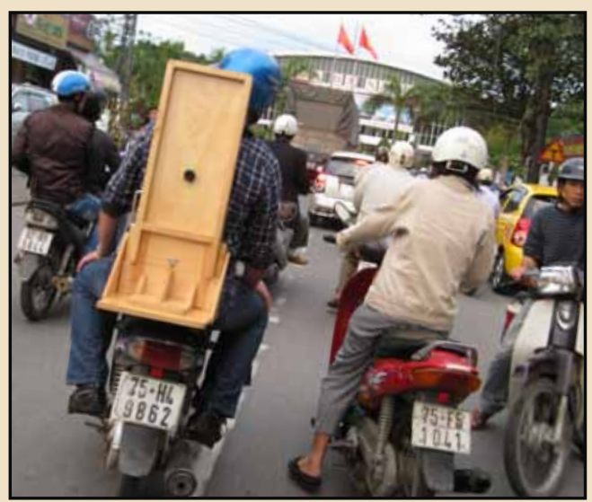
On the busy streets of Da Nang city the motorbikes are the most agile 'friends'. Da Nang city