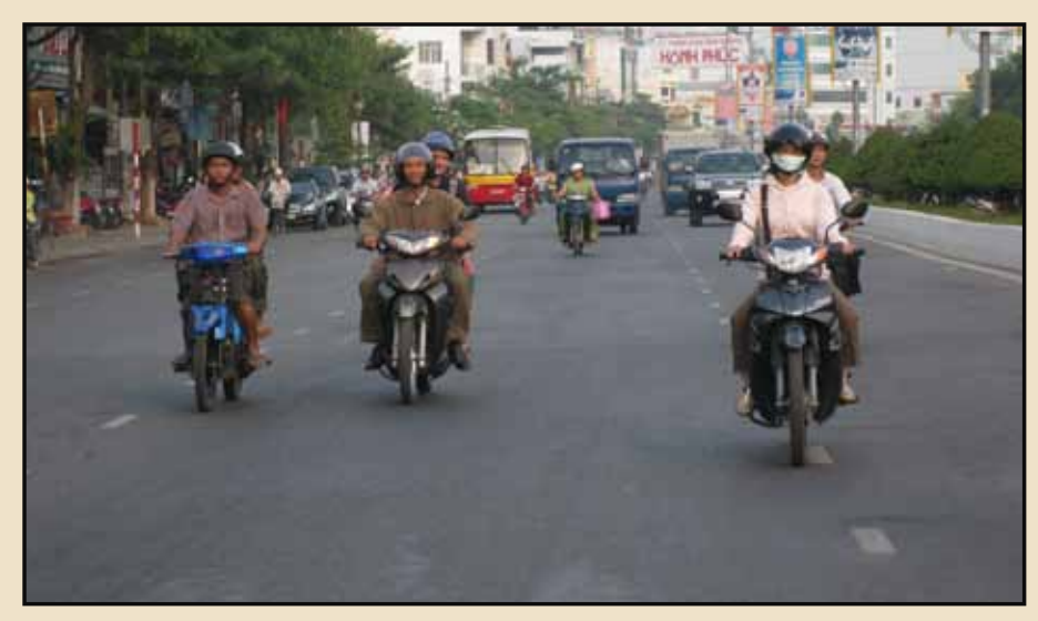
The early morning ride from Rach Gia town to Tan Thanh commune. Kien Giang province