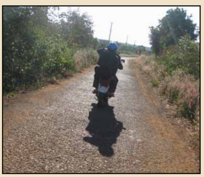
The central highlands MICS romance in an afternoon- rural-motorbike ride. Bo Ngoon, Gia Lai