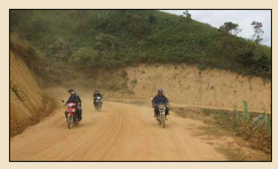
The road to Hang Tro was dusty and difficult at times, but the team was up to the challenge. Dien Bien