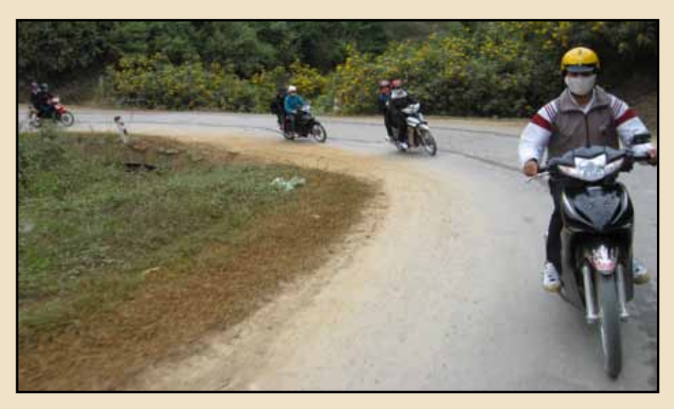
It is safer to ride in a convoy of motorbikes. The team on the way to Hang Tro village, Dien Bien province